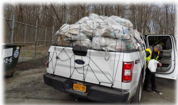
Pictured above left is the final report from the contractor, and above right is a photo of one of the several truckloads of litter collected during cleanup efforts.