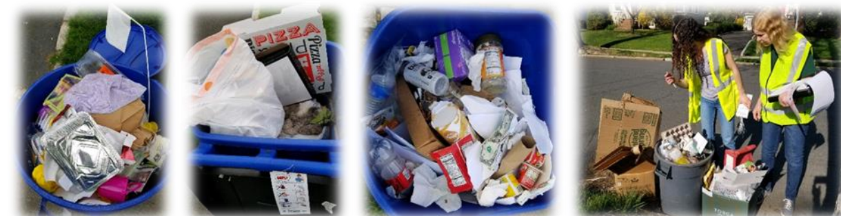
Borough of Chatham residential recycling setouts tagged and stickered for contamination issues. The three photos on the left and middle show containers recycling containers with unacceptable materials such as textiles, undesirable plastics, batteries, trash, and food-contaminated materials. The photograph in the middle shows US currency set out for recycling. The picture on the left shows MCMUA personnel during inspections.

A final round of inspections is scheduled for Friday, May 12, 2023, which will include commercial, municipal, and hot spot locations requested for review by the Borough and a reinspection of properties tagged during the previous weeks.