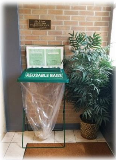
Above is a photo of the collection container for reusable bags at the Morristown Table of Hope.

On April 14, 2023, District Recycling Coordinator Anthony Marrone and District Clean Communities Coordinator Cheryl Birmingham assembled, dropped off, and provided education on using the MCMUA-provided reusable bag clear stream collection containers provided to the Table of Hope food pantries for use in their programs. Reusable bags will be collected in each pantry in the interior vestibule for the patrons to bring back their reusable bags or for donations from the public in a secure and monitored location. In addition, any excess bags collected will be shipped back to the Community Food Bank of New Jersey to warehouse them in a centralized location for bag requests from partner agencies. Over the month, several hundred bags have made their way through the collection, sanitization, and redistribution process at this site in support of food pantry efforts helping to focus funding on healthy food options.