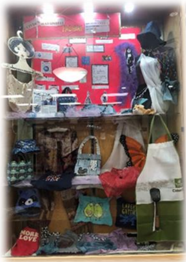
Pictured above are the photos of the display cases at the Morris County Library